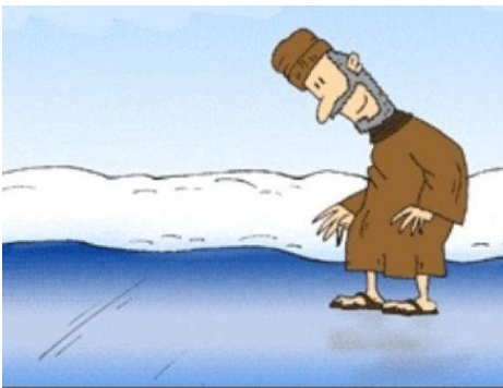
(See Matthew 14:24-33) PETER FINDS HIS FAITH TO BE MUCH STRONGER IN THE WINTER